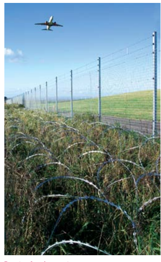
Procter fencing systems Comprehensive service for security fencing, gates and barriers. www.fencing-systems.co.uk

First Choice Solutions for Machine guards